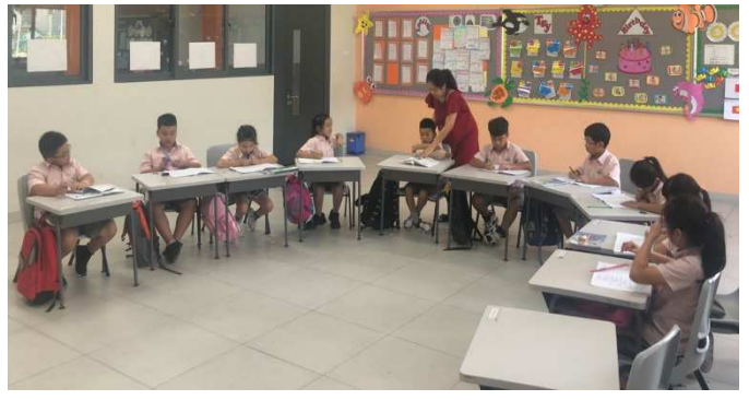
Y3 Students working well