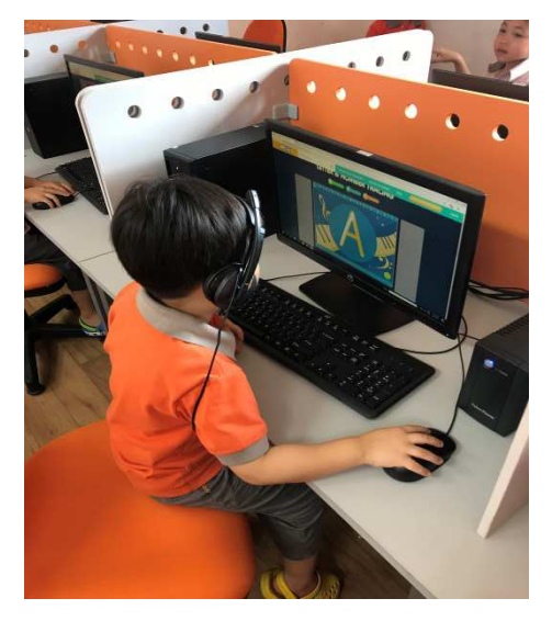
KIK students practicing mouse control during ICT

SIS @ Halong, Hung Thang Urban & Service Area, Hung Thang Ward, Halong City, Quang Ninh Province, Vietnam Email: vnguvnh baotranghai@halong sis edu vn