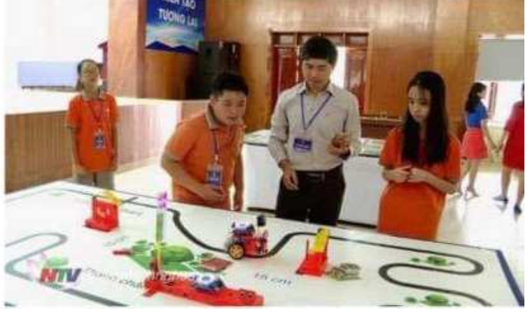
Students working on Robotics in STEM