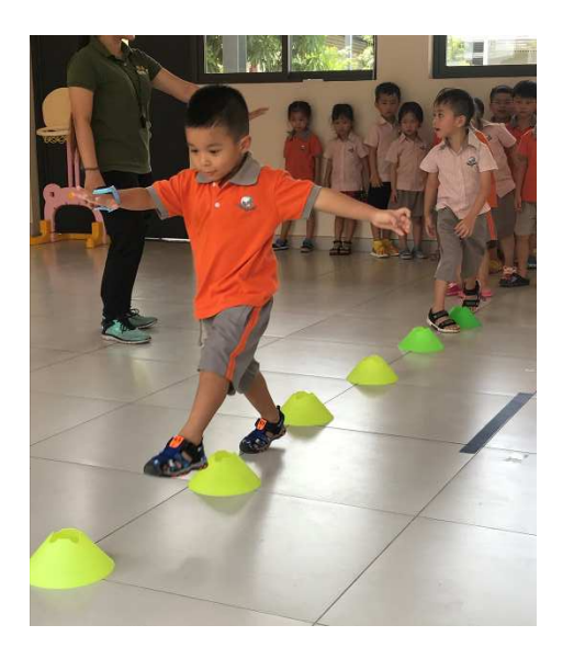
KIK students developing gross motor skills through PE lessons