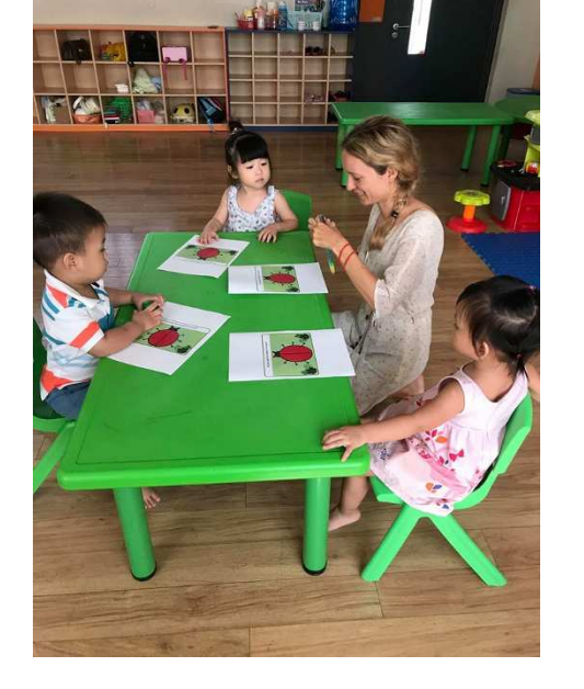
Our KIK students engaged in ART activities