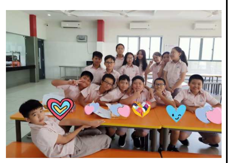
Having some downtime with a little party in the canteen

SIS @ Halong, Hung Thang Urban & Service Area, Hung Thang Ward, Halong City, Quang Ninh Province, Vietnam