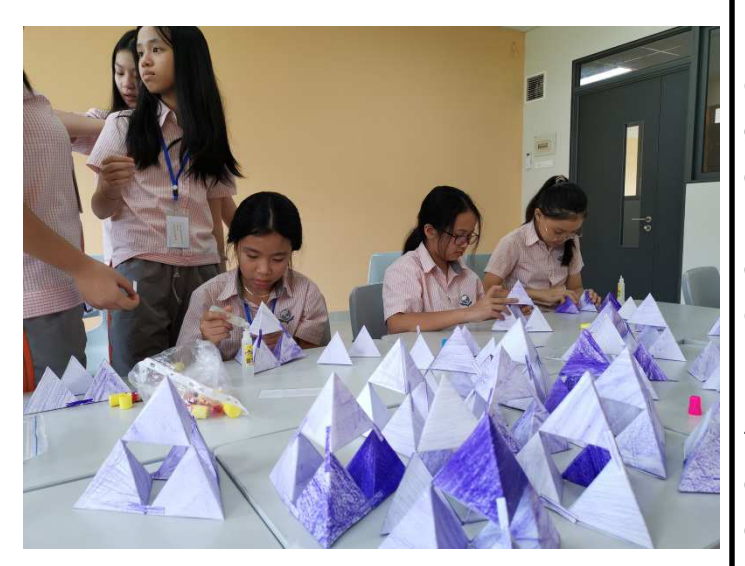
Our Olympiad students working on the Sierpiński triangle