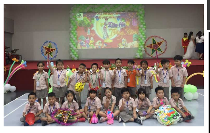
Yr 1 Students at the Moon Festival