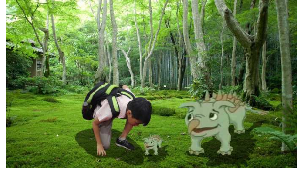
4th Grader - Vinh