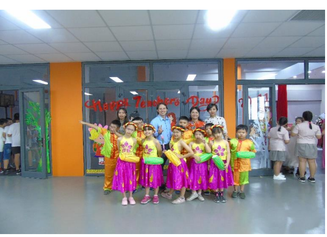
TEACHER DAY 2018