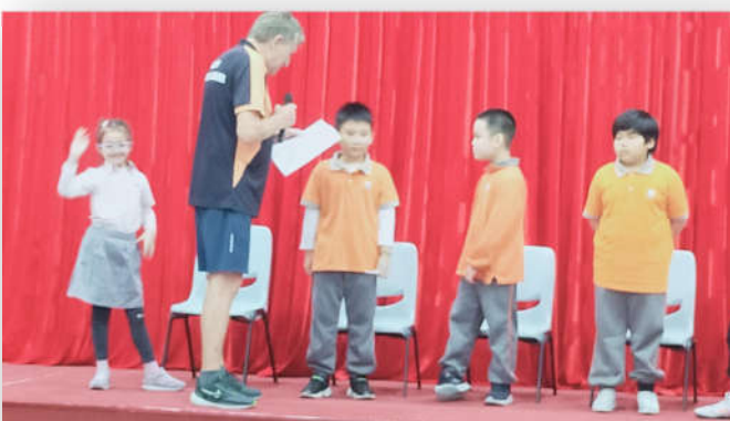
Primary Spelling Bee students compete to be the overall Spelling Bee champion.