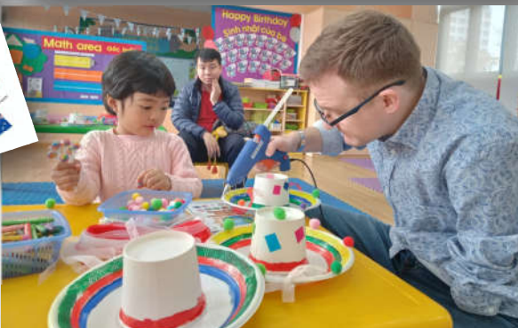
From above: banh Chung making as part of Tet celebrations, and Kinderwonders making a Mexican sombrero during the KIK event "Teddy's adventures around the world"