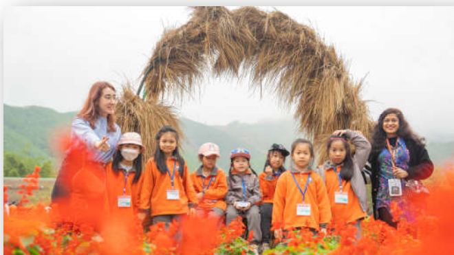
Students from Year 2 On their field trip to the Hoang Bo flower gardens