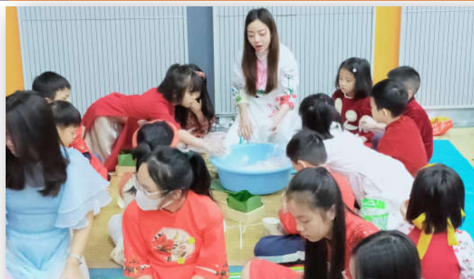
Above: Bánh Chung Making as part of Tet celebrations– the primary students seen here being guided by their teachers.