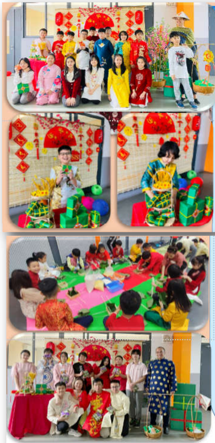
From Above: Tet celebrations saw our students come in dressed in their traditional ao dai's, and making traditional chung cakes or Banh Chung.