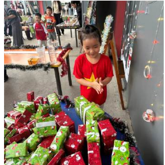
'LITTLE WONDERS' IN AWESOME WONDER

It was truly a special moment to cherish the enchanted memories of Christmas. As we close the calendar year, we look forward to sharing more magical and merry moments with you all in the new year!