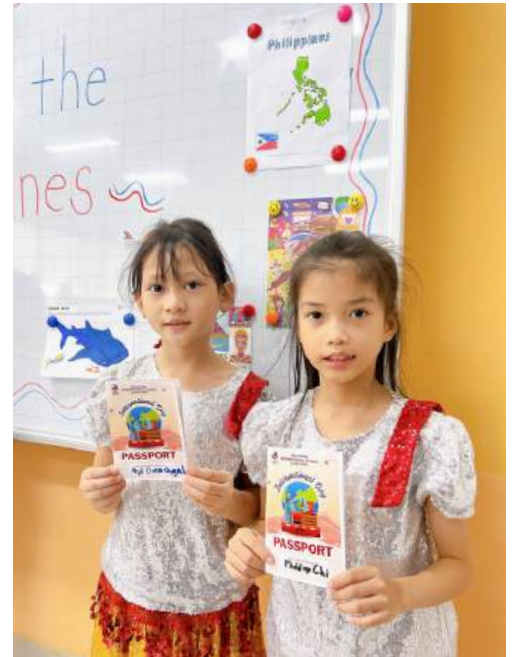
GLOBAL CITIZENS IN THE MAKING! TWO PROUD SIS HL STUDENTS AND THEIR INTERNATIONAL DAY PASSPORTS. ✨

Singapore International School @ Ha Long