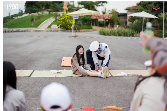
LEARN ALL YOU CAN, THEN GIVE YOUR BEST!