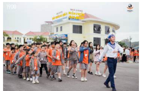
A GREAT EXCURSION - MARCHING FORWARD, TOGETHER!