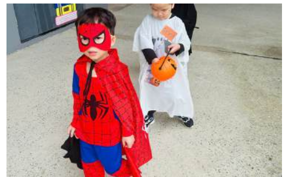
'LITTLE ZOMBIE AND SPIDER MAN' ON TRICK OR TREAT PARADE