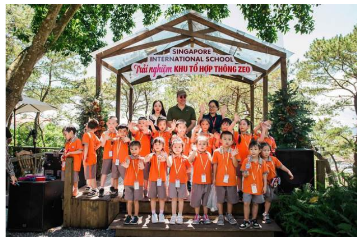
TIME TO POSE! NEVER STOP EXPLORING!