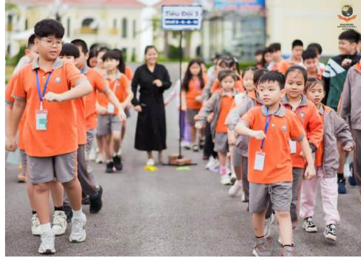
RHYTHM AND UNITY: ONE BAND, ONE BEAT.

Throughout the experience, the students displayed enthusiasm, seriousness, and initiative. They not only gained practical knowledge but also developed essential skills such as self-discipline, teamwork, listening, and following orders—contributing to building confidence and a positive attitude in both their studies and daily life.