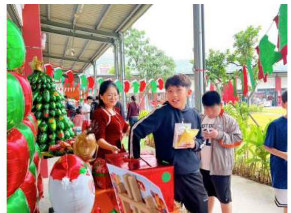
HO HO HO—PURE JOY FROM OUR SIS HL CREW AT THE CHRISTMAS FAIR! 🌟🎉