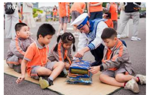
EXPERIENCE AND ATTITUDE BEAT CLASSROOM LESSONS.