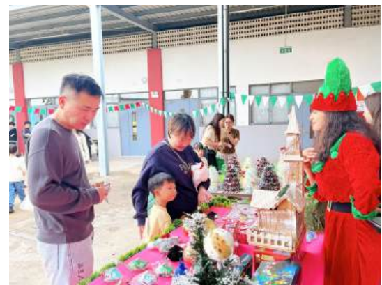
CHRISTMAS - IT'S THE MOST WONDERFUL TIME OF THE YEAR!