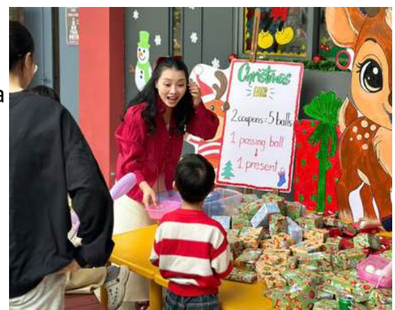
FEED THE REINDEER AND BE A 'KINDER WINNER!'