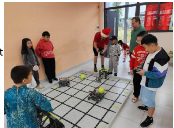
OUR CURIOUS 'LITTLE STARS ' WATCHING THE ROBOT SHOTS