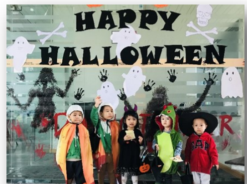
Our Kindergarten children posing for a photo in front of the school office.