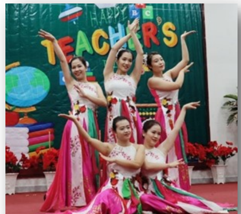
Our KIK teachers showcasing a traditional Vietnamese dance as part of teachers day celebrations.