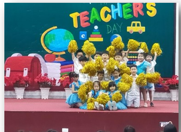
Below: Year 3 students put up an amazing performance on teachers day. Members of staff posing for a Photo on stage.