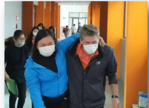
Our Teachers taking part in the Fire Drill exercise