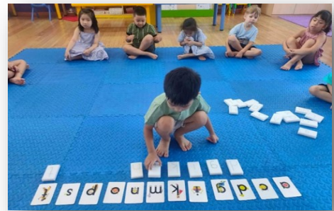
Our Prep students engaging in hands-on activities during Literacy lessons

We had a lovely Teachers' Day celebration in November where some of our kindergarten teachers performed a Vietnamese dance. Their dance was very well received with everyone showing their appreciation with loud applause.