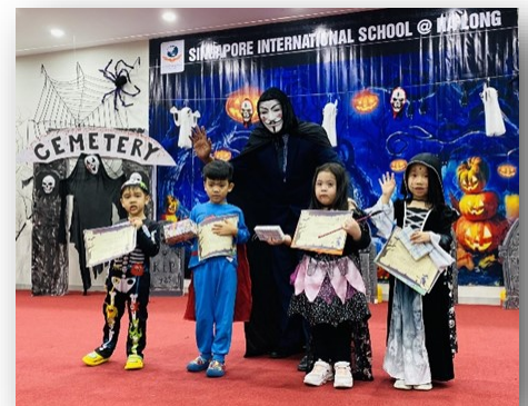
Students in lower primary receiving the awards for Best Halloween Costume"