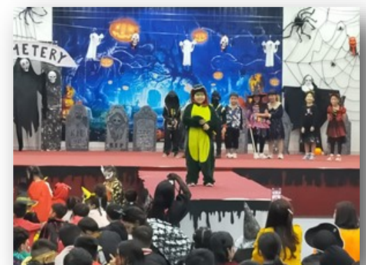
Above : our KIK and Primary students participating in Halloween activities.