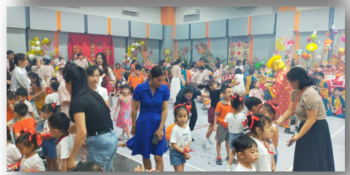
Our kindergarten children joining in the celebrations for the Mid– Autumn festival with our primary, secondary and high school students