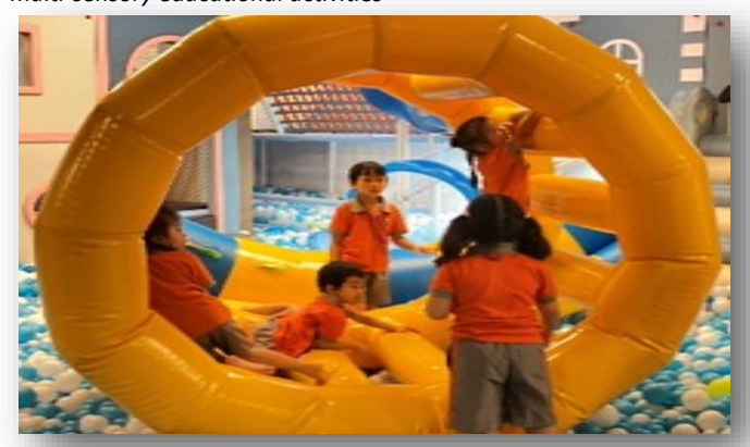
Our Kinderwonders having a ball of a time during their first excursion