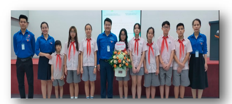
Above: The Ho Chi Minh City Youth Council Initiation Ceremony with Officials from the HCMC Youth Pioneers organization posing for a photograph with student leaders.