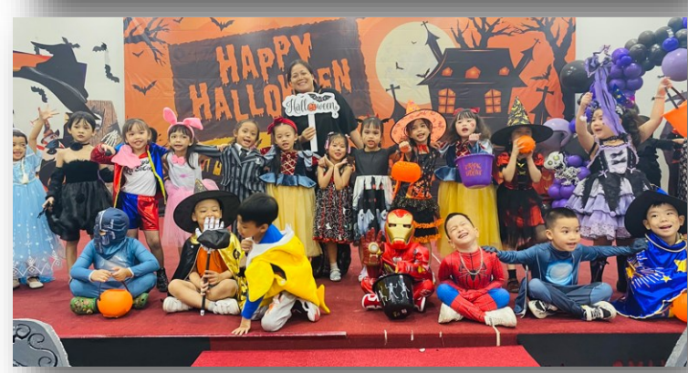
From Top: Our 4 finalists in the National-wide Robotics championships, Students studying on the Neo platform, Students of the month for October, posing with their certificates, Halloween Celebrations 2023