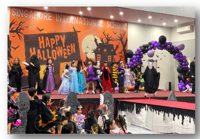
Halloween Celebration in the school on the 31st of October saw many students dressed up in their Halloween costumes and taking to the catwalk. There were certificates awarded for the best costumes and best spooky drawing for each class.