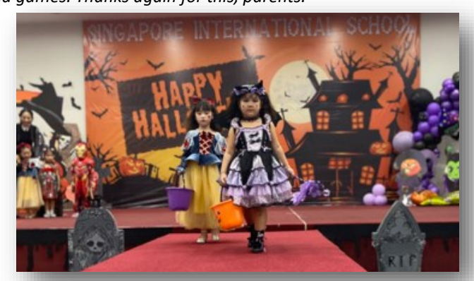
Above: Our prep students in their costumes take to the catwalk at our Halloween celebrations

We applaud parents' efforts in sending their children to school in the correct school uniform, and would like to thank them sincerely for their effort. When children wear their uniforms, they realise that they are going to school to study seriously, not just have a day of fun and games. Thanks again for this, parents.