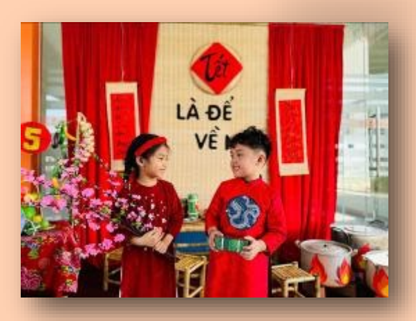
Happiness is the best gift this TET! Let's share it together!