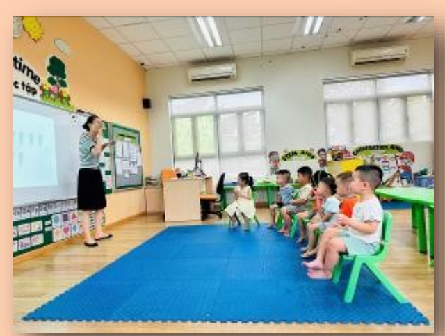
Learning is fun!

Thank you for your continued support and engagement in your child's education. We look forward to an exciting term filled with growth, exploration, and joy!