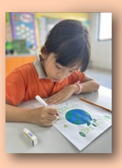
Every page is a new adventure!