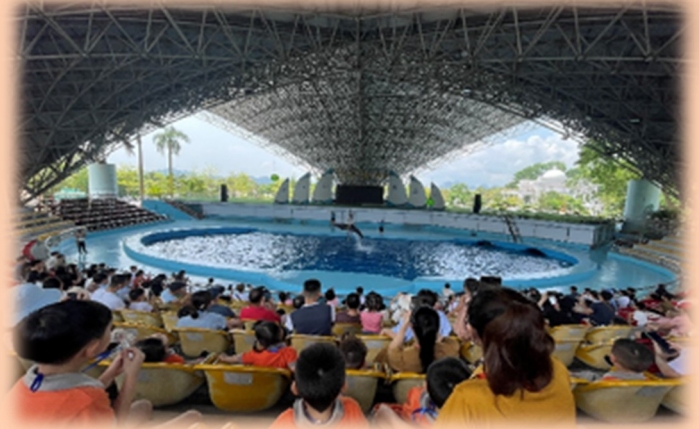
Our KinderKids watched Dolphin and Seal show and enjoyed the taking photos with sea animals.

Engaging in after-school activities has been nothing short of spectacular, witnessing our students' blossom as they dabbled in various creative pursuits, from painting masterpieces to showcasing their talents on stage. The energy and enthusiasm they brought to every endeavor was truly inspiring.