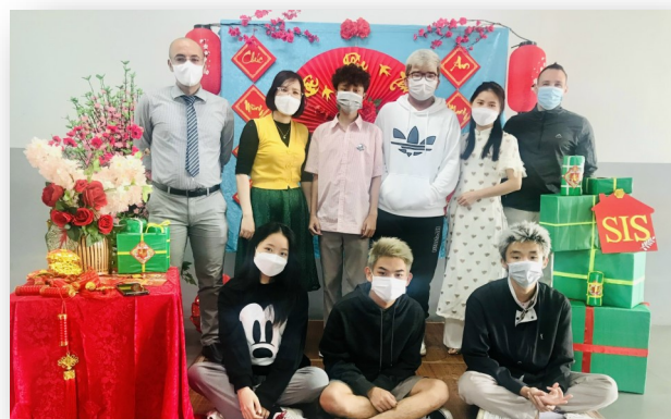
Above: Our high-school students posing for a photograph with their teachers during this year's Tet celebrations.