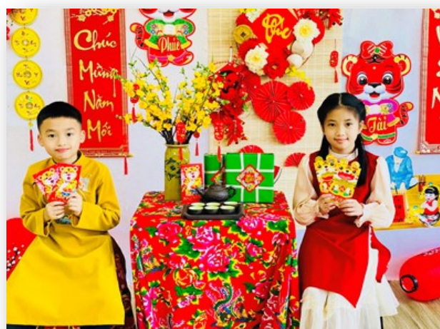
Above: Although covid-19 restrictions prevented us from having our usual concert, classrooms were decorated, and students managed to capture special moments in their well-decorated classrooms.