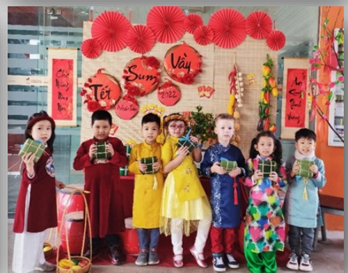
Clockwise from above: Our KIK students seen here in their traditional ao dais enjoying activities for Tet.