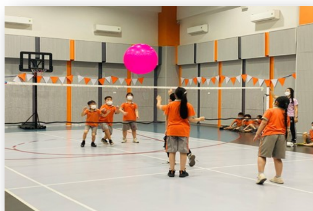
Above: Students engaging in giant-Volleyball during their health and Physical Education lessons.