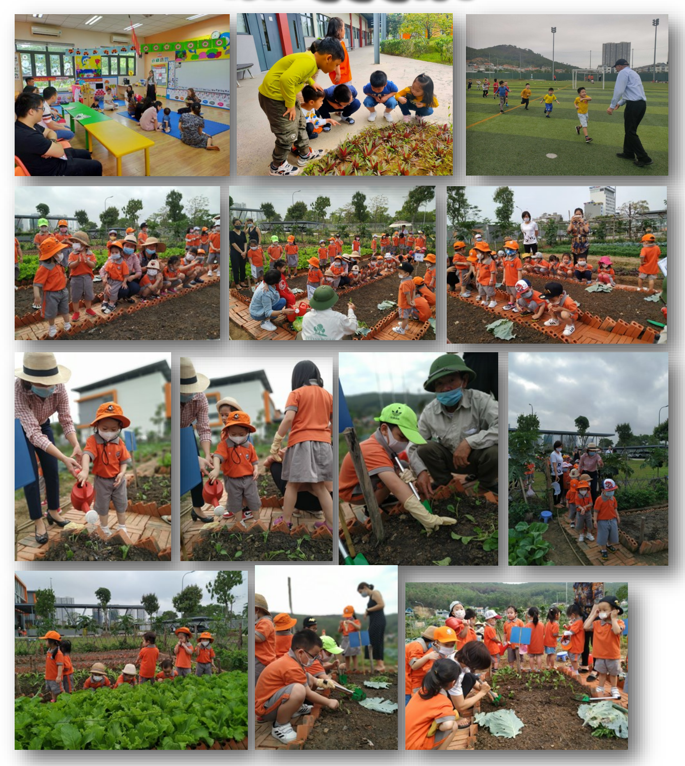
Our Students seen here on their excursion to the SIS Garden where they had a chance to plant cruciferous vegetables as part of their field trip. Some photos of the Open day and demo teaching are also included.