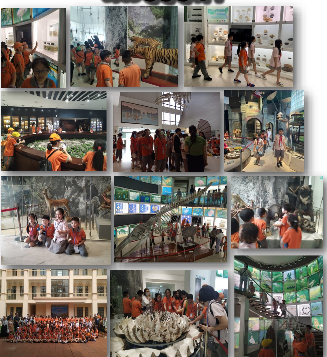
Our Students are sent here on their excursion to the Quang Ninh Orphanage and later to the History Museum. Here are more photos of them taking in the cool exhibits and learning about the History of Quang Ninh. The museum offers an impressive collection of fossilized flora and fauna found in the region. There is also a very interesting session on the Coal trade, extraction and war, in this the greatest coal producing region in Vietnam.