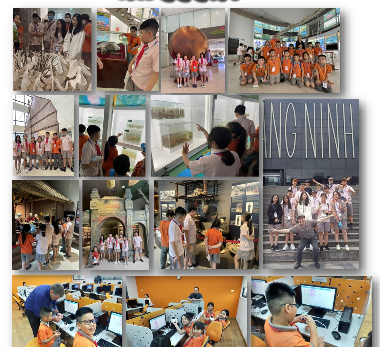
Our Students seen here on their excursion to the Quang Ninh Orphanage and later to the History Museum. Here are more photos of them taking in the cool exhibits and learning about the History of Quang Ninh. The museum offers an impressive collection of fossilized flora and fauna found in the region. There is also a very interesting session on the Coal trade, extraction and war, in this the greatest coal producing region in Vietnam. Some students below are trying their hand at robotics.