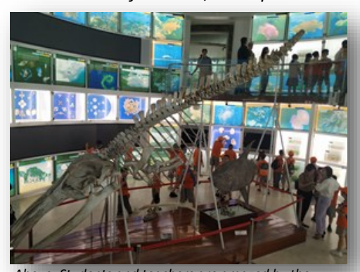
Above: Students and teachers are amazed by the scale of some prehistoric fossil remains on display. Below: Students browsed around and had many questions about the fossils they saw and how they were preserved through time.