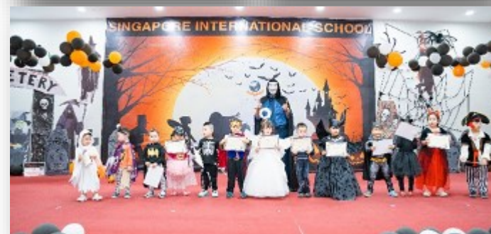
Top: Halloween celebrations in school saw many excited children celebrate in their Halloween costumes