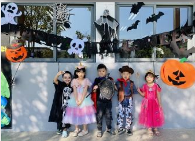
Top: Halloween celebrations in school featuring our kindergarten children posing for photographs on the catwalk, in the audience and outside their spookily-decorated classrooms